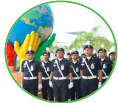
Safety and Security