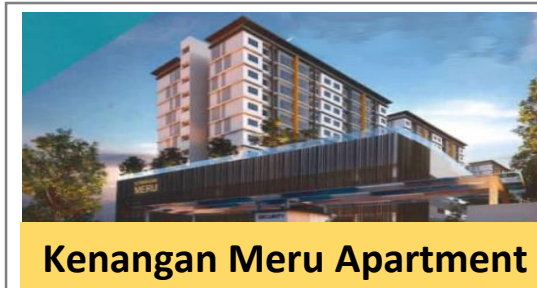
Kenangan Meru Apartment