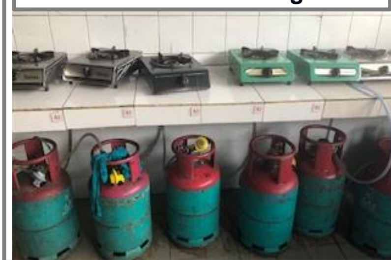
Female Hostel Cooking Area