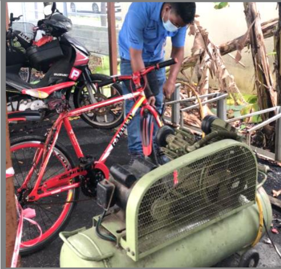
Bicycle Pump Station