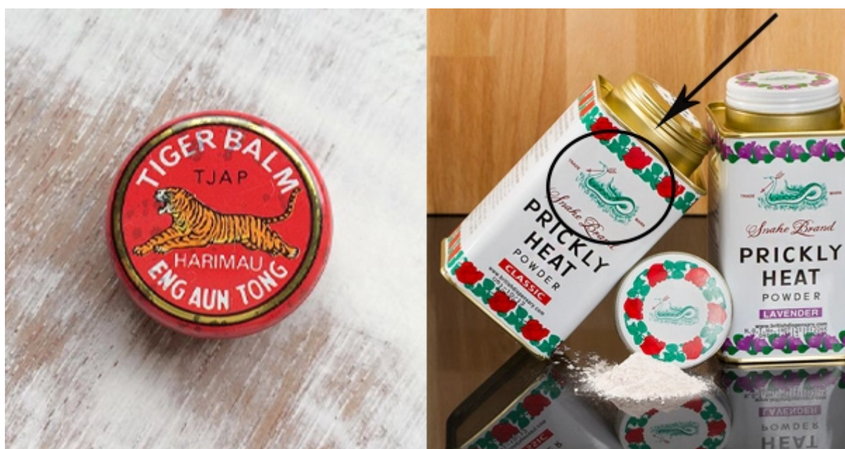
15 Common Remedies Our Asian Parents Swear By That Are Now Part Of Our Lives