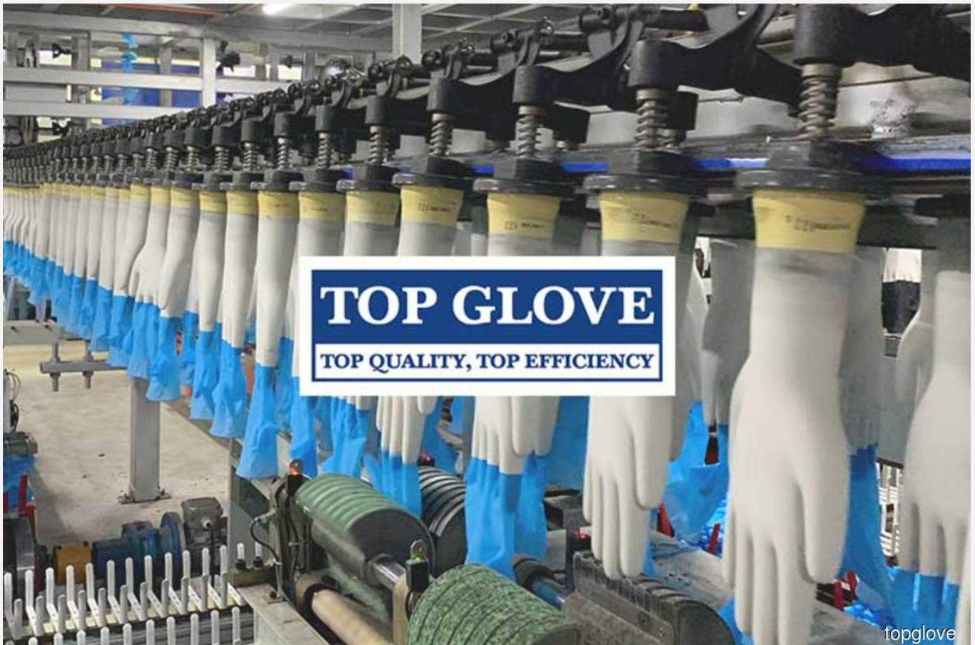
Top Glove slams Canadian TV reports about working conditions at its factories as misleading