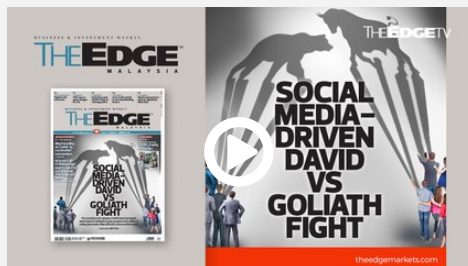
01 Feb | 02:32pm Behind the Sto...