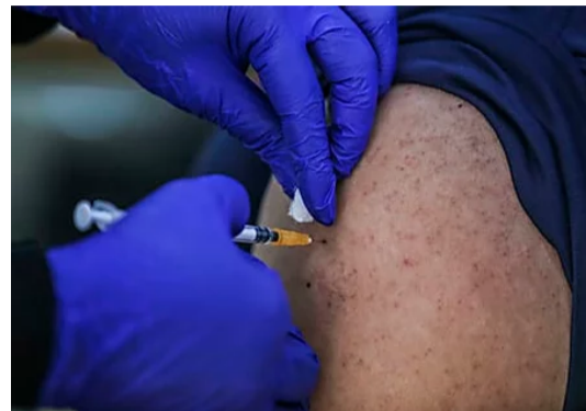
Health minister says private sector GPs will administer Covid-19 jabs from phase two onwards | Malay Mail