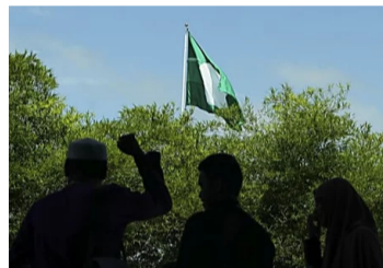
In PAS, two factions emerge as party heads towards internal poll | ...