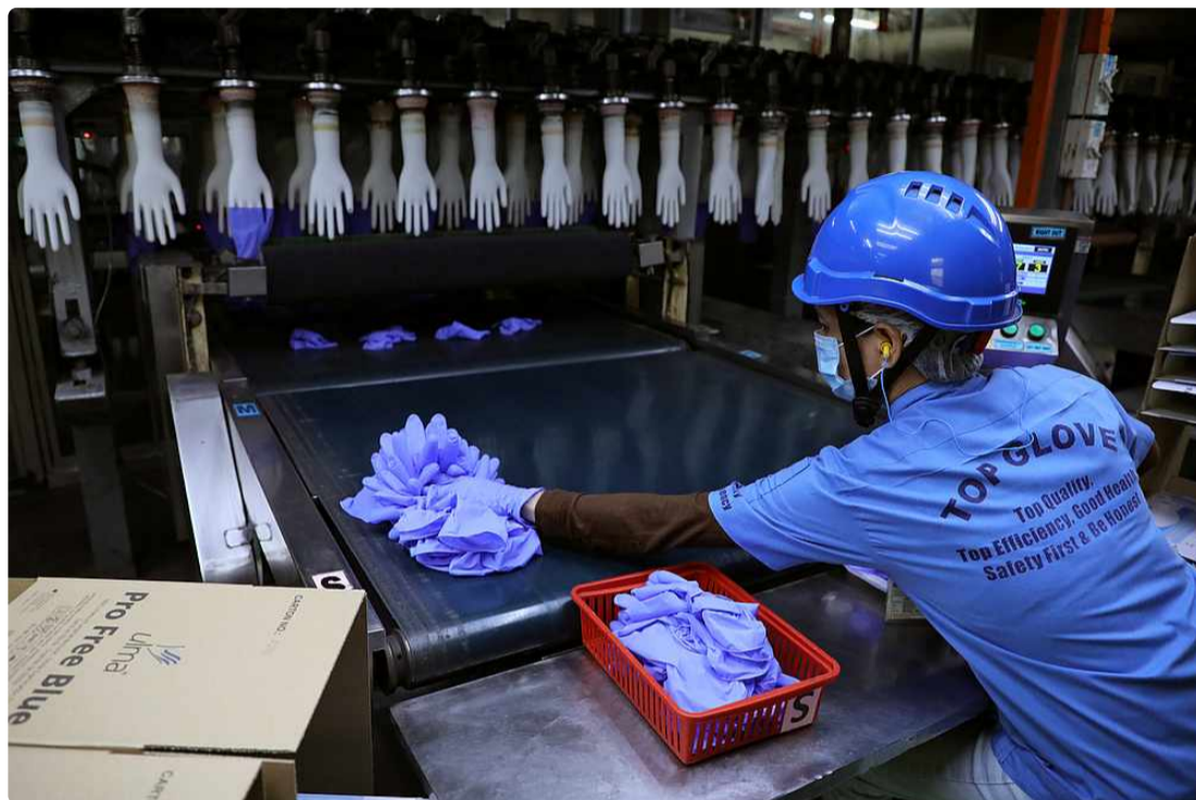
A worker at a production line in Top Glove factory in Shah Alam August 26, 2020.

Subscribe to our Telegram channel for the latest updates on news you need to know.