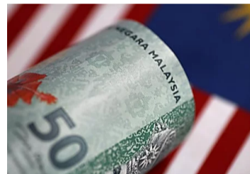
RAM Ratings: Malaysian banks' 2021 earnings likely to improve on net interes...

Harry and Meghan interview sparks shock, anger and memes on Twitter | Malay Mail